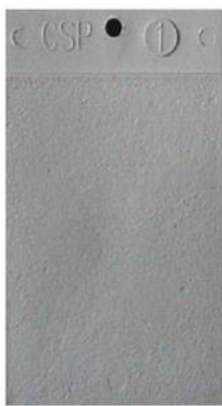
CSP-1: Acid Etched*

The concrete surface must be prepared to have an open textured structure without laitance layer. The roughness shall correspond to the profiles CSP-2, CSP-3 or CSP-4, as defined by the International Concrete Repair Institute (ICRI Guideline No. 310.2R-2013) and illustrated below. The concrete can be prepared by grinding or sandblasting.