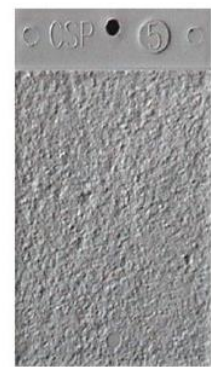
CSP-5: Medium Shot Blast