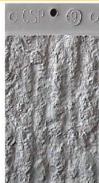
CSP-9: Heavy Scarification

After grinding or sandblasting, the surface has to be cleaned from all loose particles and dust. Brush the dust out well with a dry brush, and use a vacuum cleaner. The use of compressed air is not recommended, as it will push the loose particles into the concrete instead of removing them.