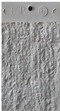
CSP-6: Medium Scarification